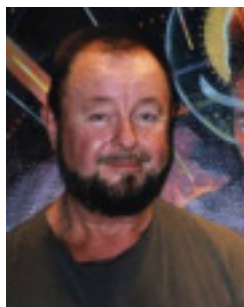
Ingo Swann, pictured,

And this dissertation is positively bulging, with conventional science references